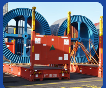
OUT OF GAUGE